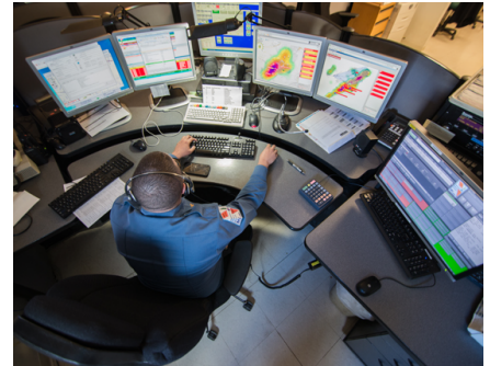
Jersey City Medical Center EMS utilizes MARVLIS to improve efficiency and operational awareness

In addition to operational data, MARVLIS PSAP Monitor has the ability to incorporate a variety of additional data types and feeds to supplement the information-rich map display. Utilize your organizational GIS data from the cloud, via map services from your own ArcGIS Server, or take advantage of the number of online basemaps from Esri such as aerial imagery or street map. Real-time data feeds such as weather warnings and radar, traffic, DOT information and others add awareness of changing conditions.